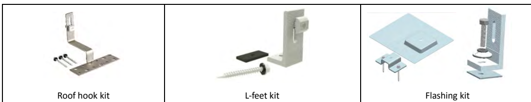
Roof hook kit